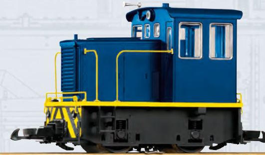
38502 Blue Goose 25-Ton Diesel Switcher (Track-Powered)