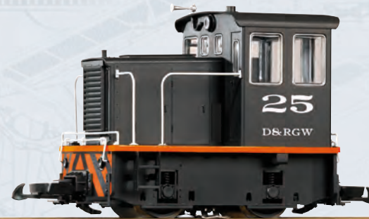
38500 D&RGW 25-Ton Diesel Switcher (Track-Powered)

See our website for the full selection of GE 25-Ton Diesel models currently available.