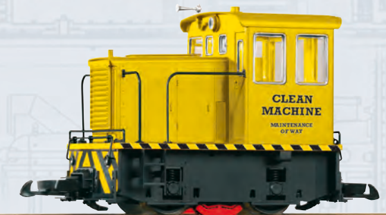
38501 Clean Machine Track Cleaning Loco, incl. 4 Cleaning Shoes

With the "Clean Machine" version of the GE 25-Ton diesel, PIKO introduces a completely new concept in track cleaning. Common household rechargeable batteries provide extensive running time. Track cleaning operation is simple - just turn it on and let it run around the layout till even heavily oxidized track is polished clean. Once the Clean Machine has cleared the way, track-powered locos can run smoothly!