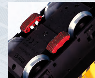
35416 Track Cleaning Shoes, 2 Sets

The Clean Machine is exclusively powered by 6 'AAA' batteries (not included - high-capacity rechargeable cells are recommended), which provide up to two hours of running time for cleaning even large layouts. The front "radiator panel" of the engine hood opens for easy access to the quick-change battery clip.